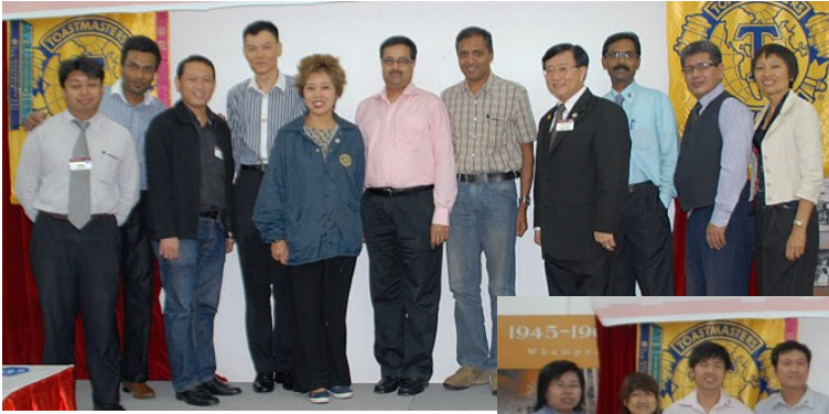
KSTMC Achievers at the Division U Achievers' Day I