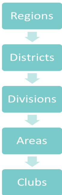
TI Organization Structure (Simplified)